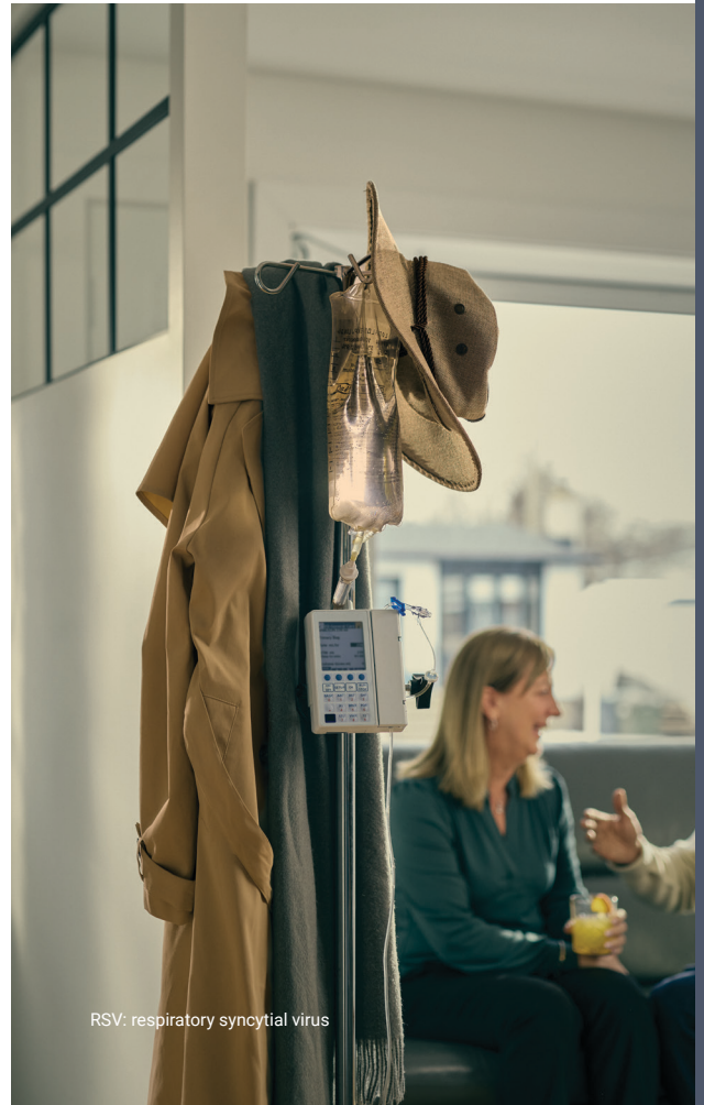
RSV: respiratory syncytial virus

Your healthcare professional can help you assess your personal risk factors.