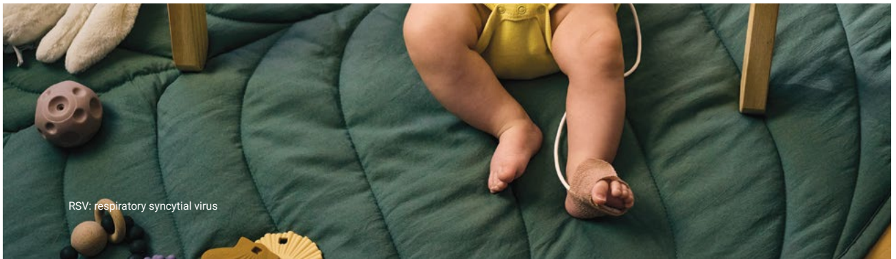
RSV: respiratory syncytial virus

Talk to your doctor about helping to protect your baby with ABRYSVO.