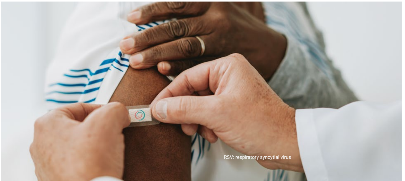
RSV: respiratory syncytial virus