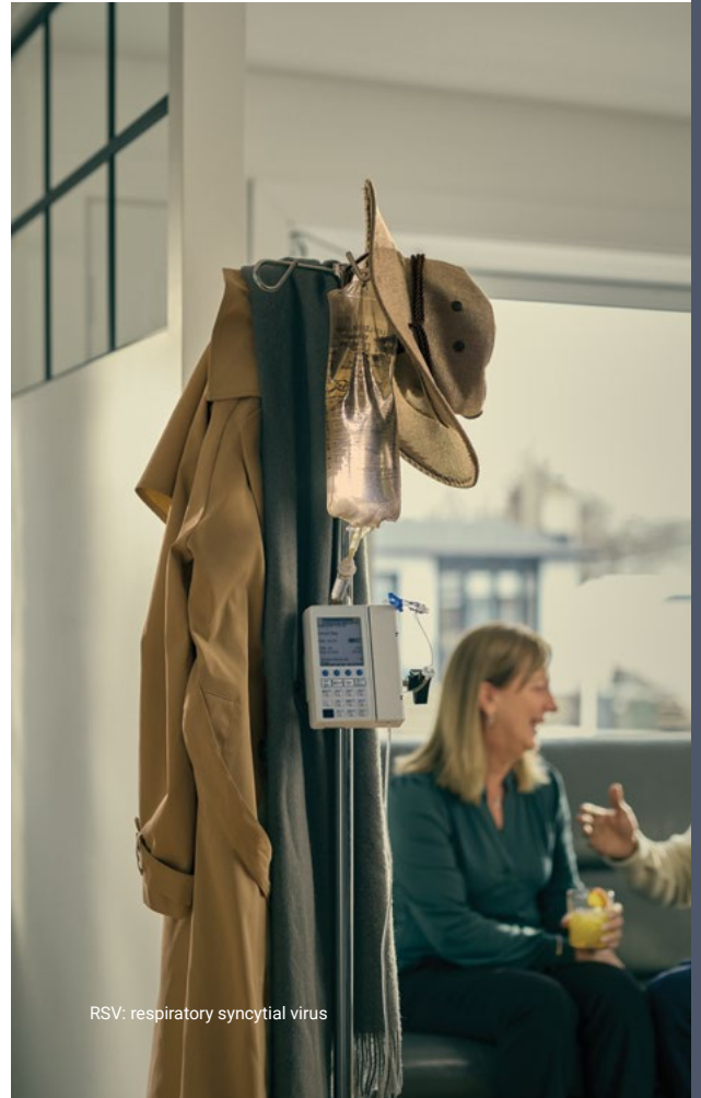
RSV: respiratory syncytial virus

Your healthcare professional can help you assess your personal risk factors.