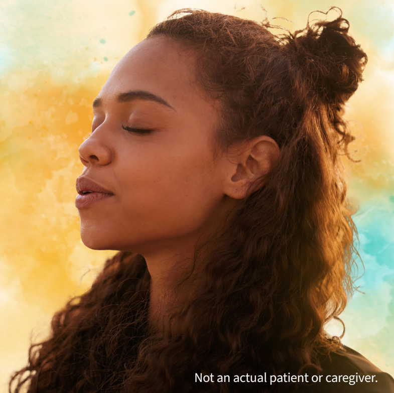
Not an actual patient or caregiver.

Caring for a loved one on top of your daily tasks is not easy